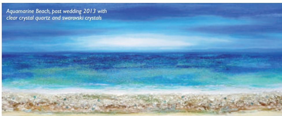
Aquamarine Beach, post wedding 2013 with clear crystal quartz and swarovski crystals

but I love it so it is worth it," she reveals. "The paintings are like my babies so it can be hard when I have finished to give them away but otherwise I would keep them all and I don't think my house is big enough for that."