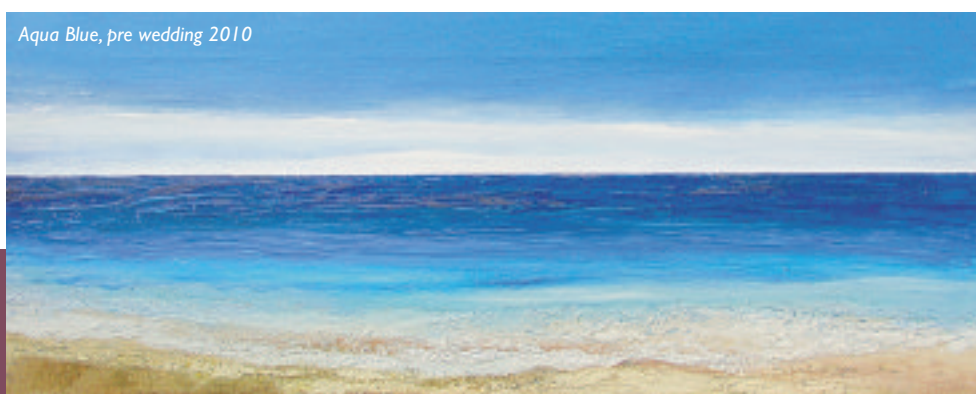
Aqua Blue, pre wedding 2010