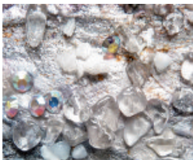
Close up of Beau Rivage, showing gemstones and crystals